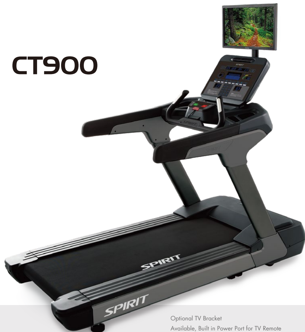
Optional TV Bracket Available, Built in Power Port for TV Remote

Robust construction and commercial-grade components make the CT900 the gold standard for treadmills. Specifications for the shocks, rollers, belt and deck were meticulously chosen to give users a smooth workout experience. Powder-coated steel and powerful motor allow owners to rest assured they have products that will stand the test of time.