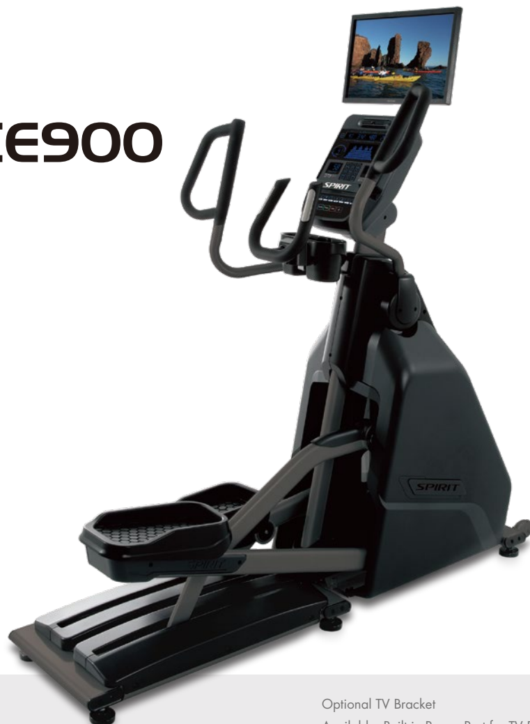
Optional TV Bracket Available, Built in Power Port for TV Remote

Workout comfort and performance were first in mind when the CE900 Elliptical was developed. From stride length and hand grips to pedal placement and flywheel inertia, this elliptical combines fit and function in one robust machine. Owners will feel secure that they've made a solid investment for their users' experience and their bottom line.