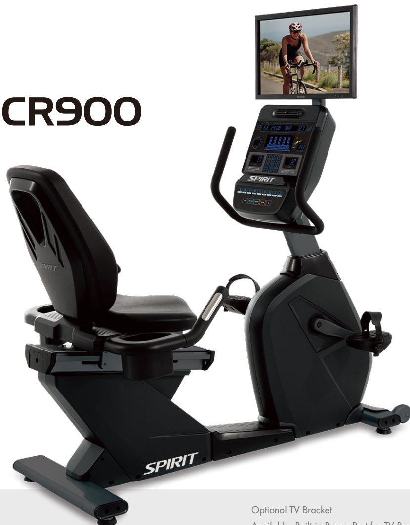
Optional TV Bracket Available, Built in Power Port for TV Remote

Built to last, the CR900 Recumbent Bike takes workout ease and comfort to a new level. Step-through design makes it easy for all users to enter and exit the bike. Molded foam seat that infinitely adjusts along the seat rail and quick ratcheting pedals make it quick and easy to get on and go. Commercial crank assembly and extra-large roller bearings provide fluid pedal motion.