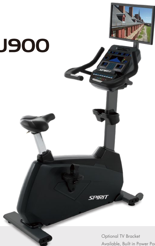
Optional TV Bracket Available, Built in Power Port for TV Remote

The CU900 Upright Bike boasts features that provide users with precise fit and function and a beautiful console to track performance. The seat height securely locks and adjusts at infinite increments while the molded handlebars provide ultimate comfort. Pedal motion is smooth and consistent with industrial roller bearings and 1" crank axle that can power through any climb.